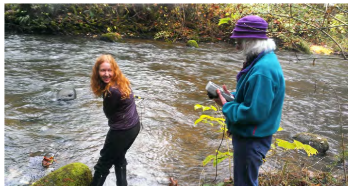
Figure 2: Stream team volunteers taking water quality samples.