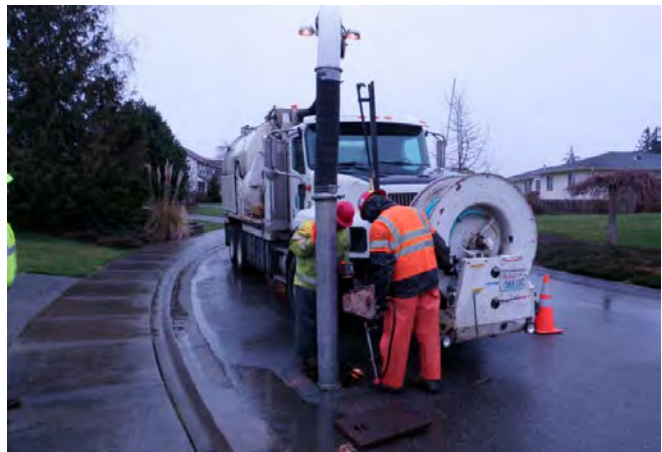
Figure 7: Public Works Crew Using a Vactor Truck