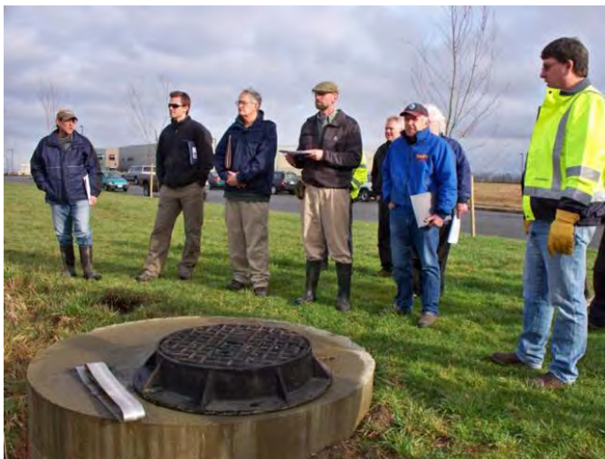
Figure 6: Private Stormwater Facility Workshop